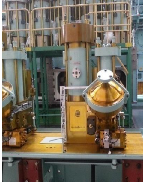
► S50ME/ME-C - HCU