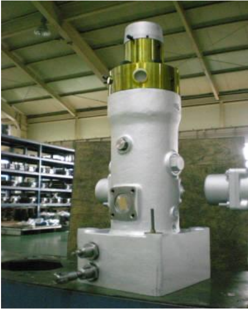
► K80MC/MC-C - Fuel Pump Ass'y