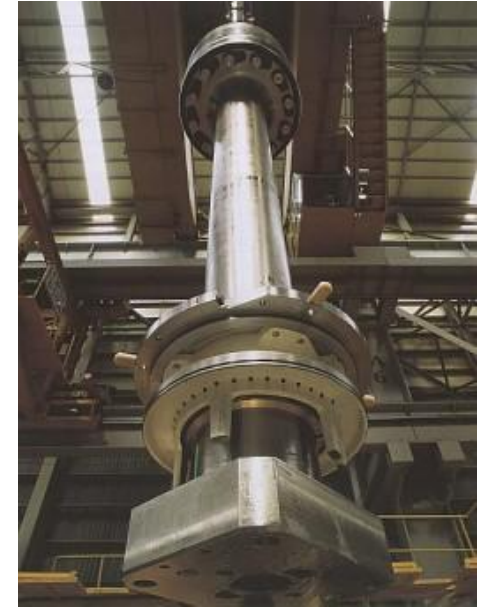
► Stuffing Box