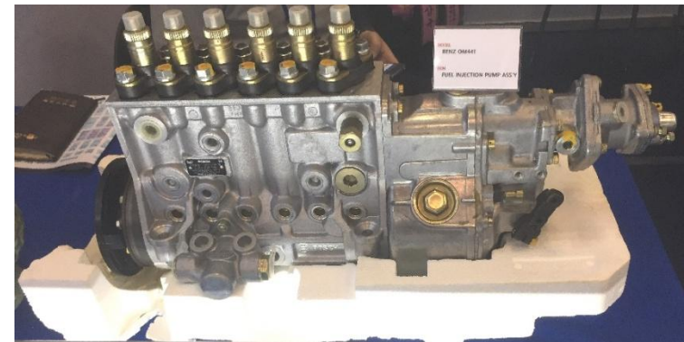
► BENZ OM441 - Fuel Injection Pump Ass'y