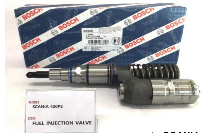
► SCANIA - Fuel Injection Valve