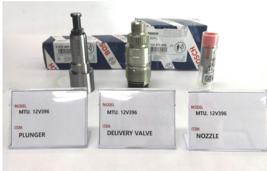
► MTU 12V396 - Plunger / Delivery Valve / Nozzle